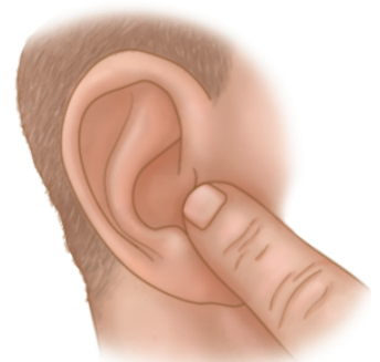
Pumping the tragus