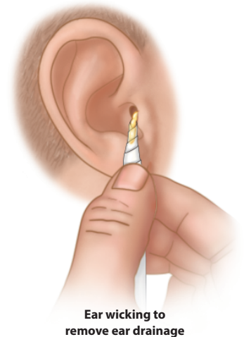
Ear wicking to remove ear drainage