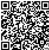
QR code for mobile view