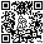
QR code for mobile view