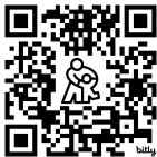
QR code for mobile view