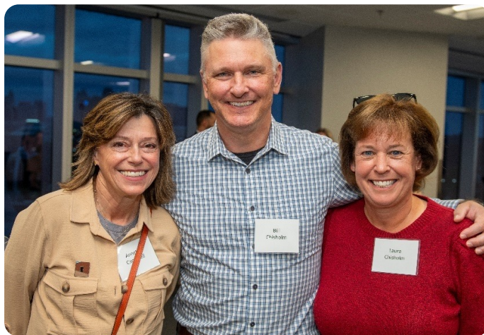
FAB 20th Anniversary Celebration