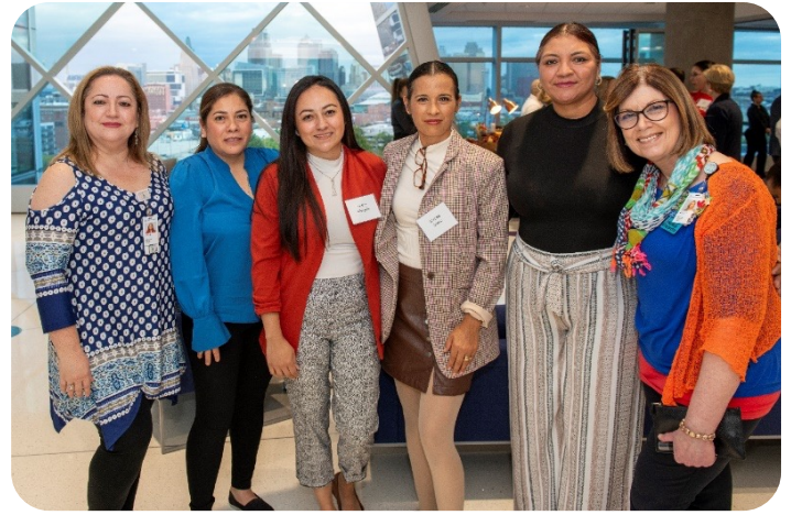
Consejo members at 15-year celebration.