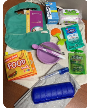
Newborn CF Diagnosis bags