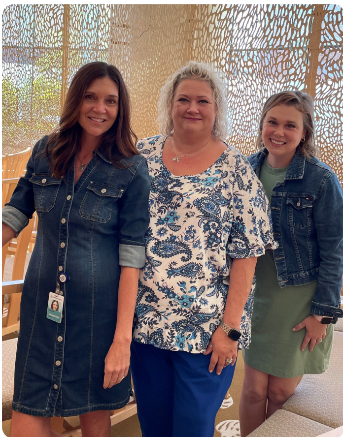
Rare PFAC members