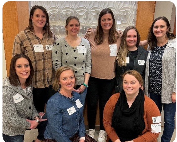
FHC PFAC members