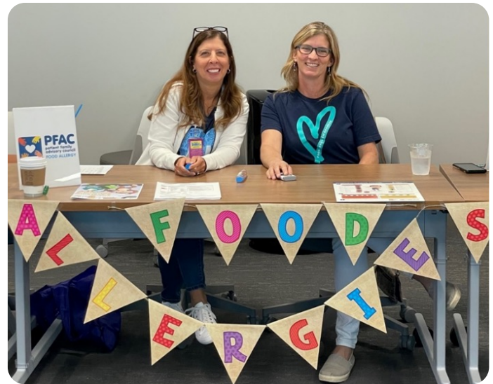
School Nurse Conference