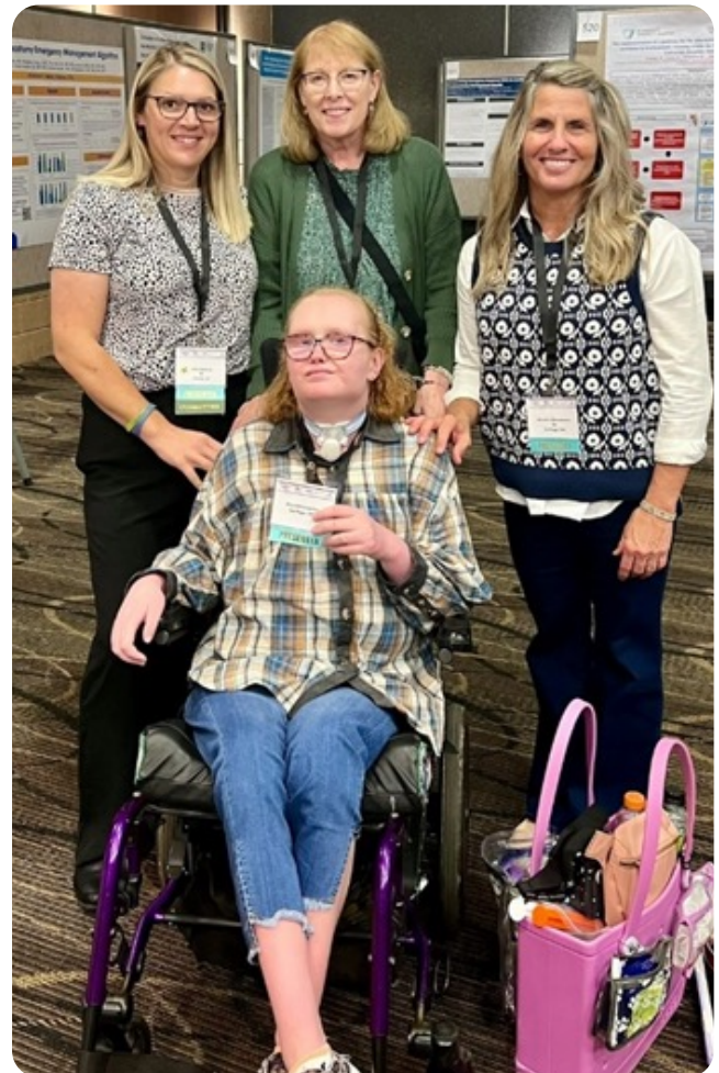
Global Tracheostomy Collaborative