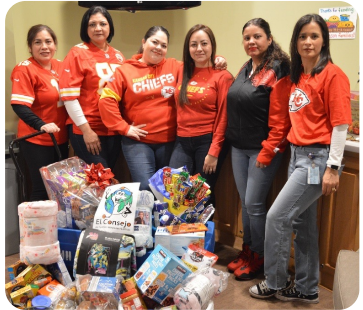
Consejo members delivered items to 4H Parent Room.