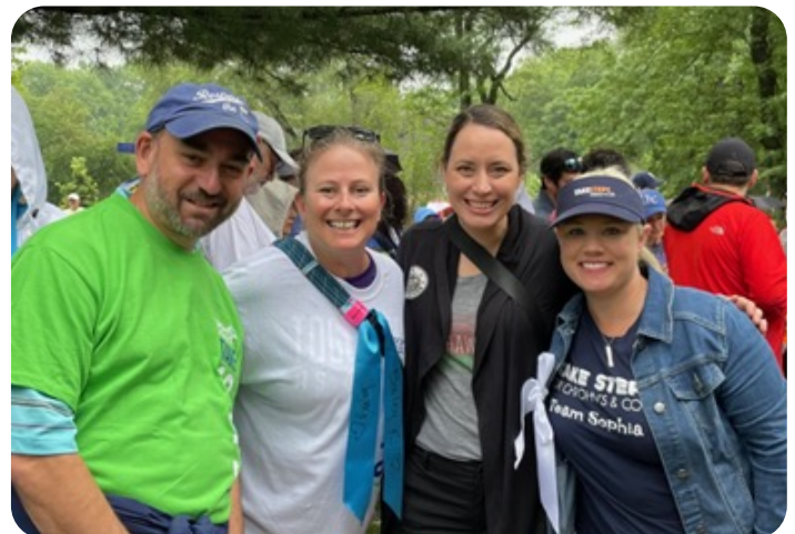
Crohn's and Colitis Foundation Walk