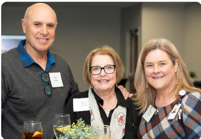
FAB 20th Anniversary Celebration