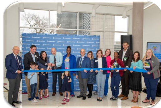
PFAC members at the opening of Angelman Syndrome Clinic