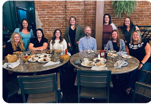
PFAC members at the Parent Symposium