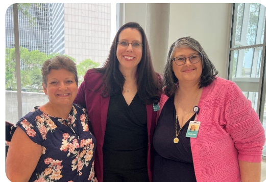
PFAC members at the Transition to Adult Care Conference for Medically Complex Patients