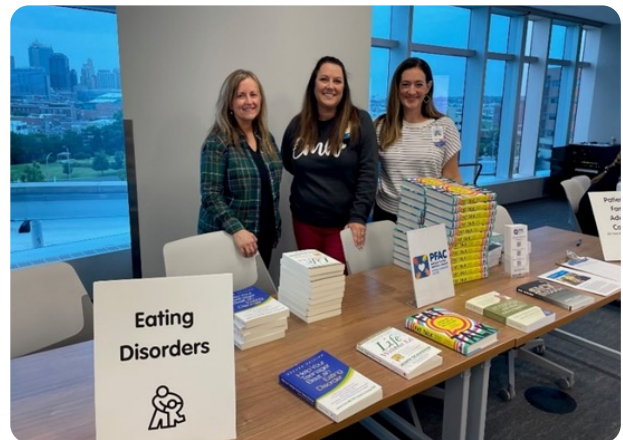
School Nurse Conference