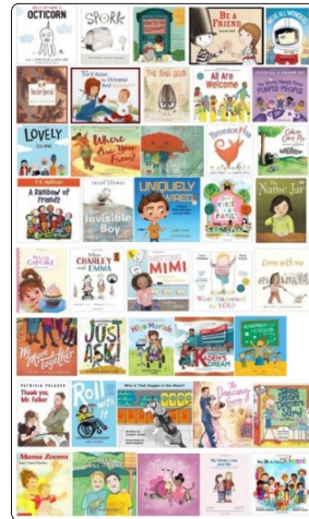
Inclusive Children's Book List, recommended by Children's Mercy Kansas City Accessibility & Rehab PFAC