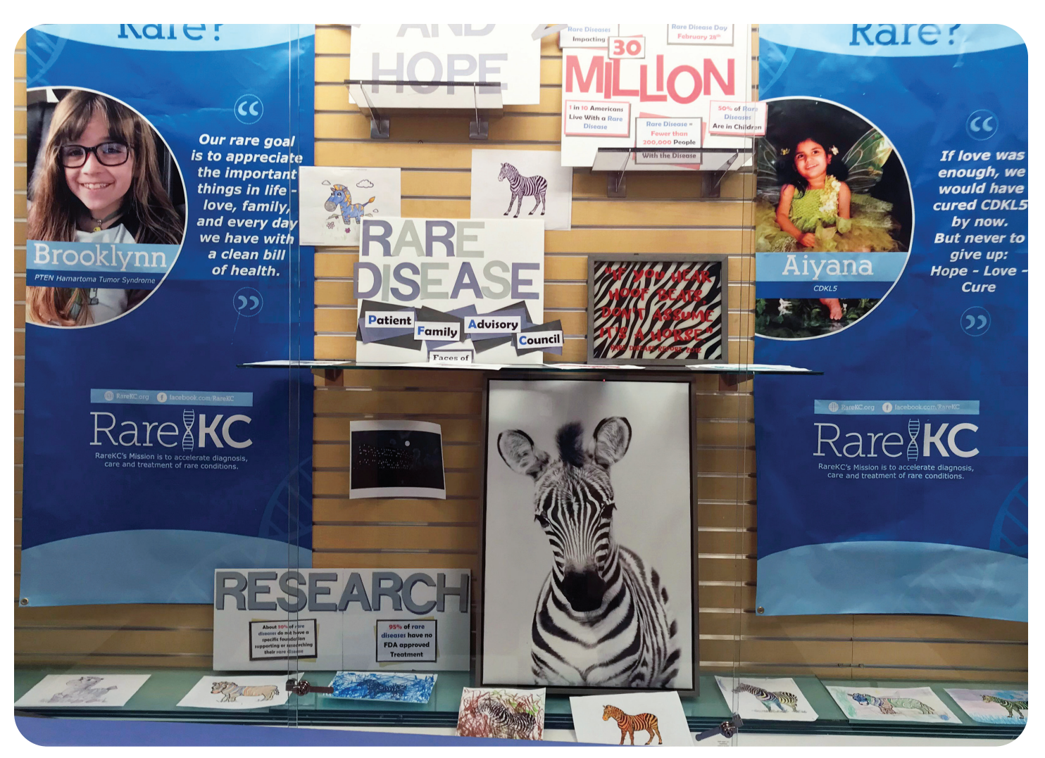
Window display raising awareness about rare diseases.