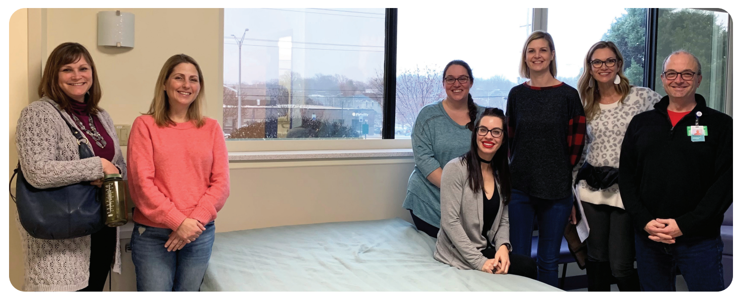
Kansas PFAC members toured the Sleep Lab before the pandemic.