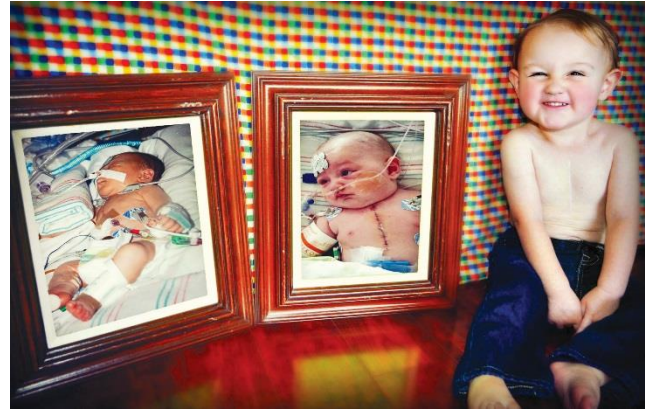
Post-surgery and feeling great!

"The post- surgery period was filled with highs, lows, and mixed emotions. Ultimately, at discharge, I felt a sense of pride and relief. We'd made it to safer ground."