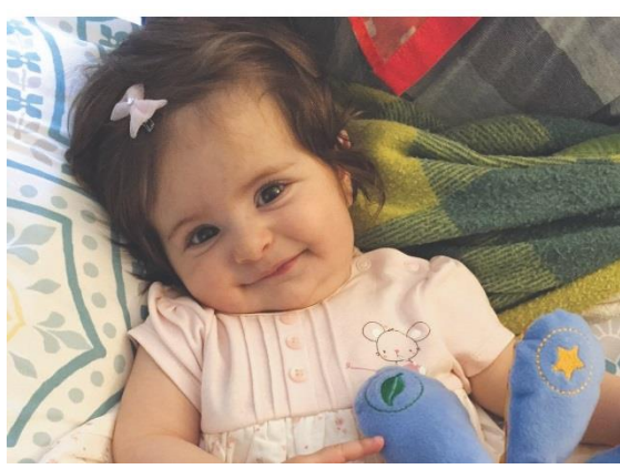
Snuggling at home.

"For our family, we coped by staying organized, continuing to advocate for our child, and doing our very best to take care of ourselves."